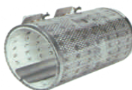
Ceramic Perforated Heater