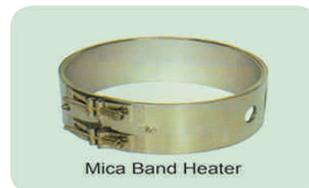
Mica Band Heater