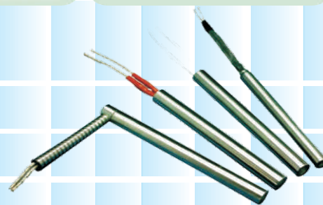
Cartridge Heater Low & High Density