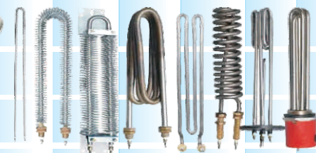
Tubular Heater (Oil Immersion Heater, Water Immersion Heater, Air Heater, Oven Heater etc.)