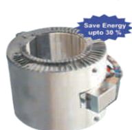
Ceramic Heater With extra insulation

Manufacturers of : ALL TYPES OF INDUSTRIAL HEATERS FOR PLASTIC, RUBBER, PHARMACEUTICAL, CHEMICAL, CORRUGATED BOX ETC INDUSTRIES