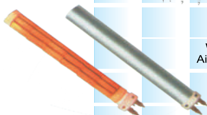
Ceramic Bobbin Heater