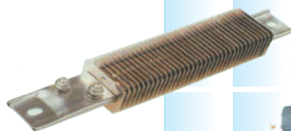
Strip Heater With Finnes