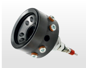
TECHNICIAN ACCESS PORT