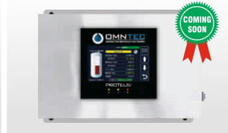
OUTDOOR PROTEUS K