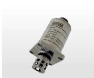
DENSITY MEASUREMENT SOLUTIONS

EXPERT IN TANK GAUGING AND LEAK DETECTION SYSTEMS, LEVEL AND DENSITY MEASUREMENT