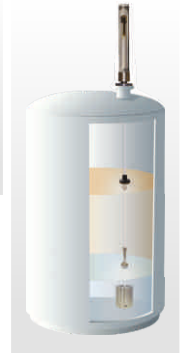
FLEXIBLE PROBE UPTO 23 MTR.