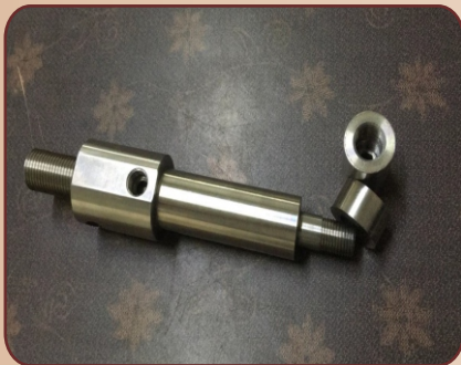
SS Water Cooling Blow Pin

Bimetallic screws give better wear resistance than gas nitride screws. Hence, these are preferred for glass filled, reprocessed and some engineering plastics. As the flights of the screw are most exposed to abrasion & corrosion; in order to minimize the rate of wear, hard coating with wear resistant material can be done on the outside diameter of the screw.