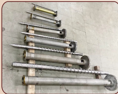
Screws & Barrels